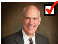
Mayor Kent Stuebaker